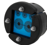
Roxtec CRL 4"/5 Roxtec CRL 5"/5