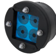
Roxtec CRL 4"/4 Roxtec CRL 5"/4