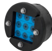
Roxtec CRL 4"/9 Roxtec CRL 5"/9