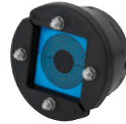
Roxtec CRL 4"/1 Roxtec CRL 5"/1